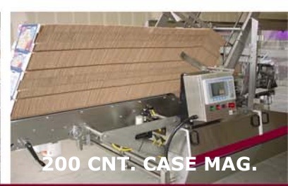
200 CNT. CASE MAG.