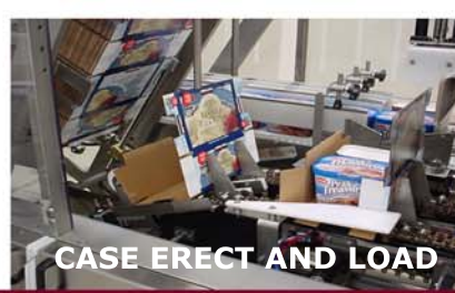
CASE ERECT AND LOAD