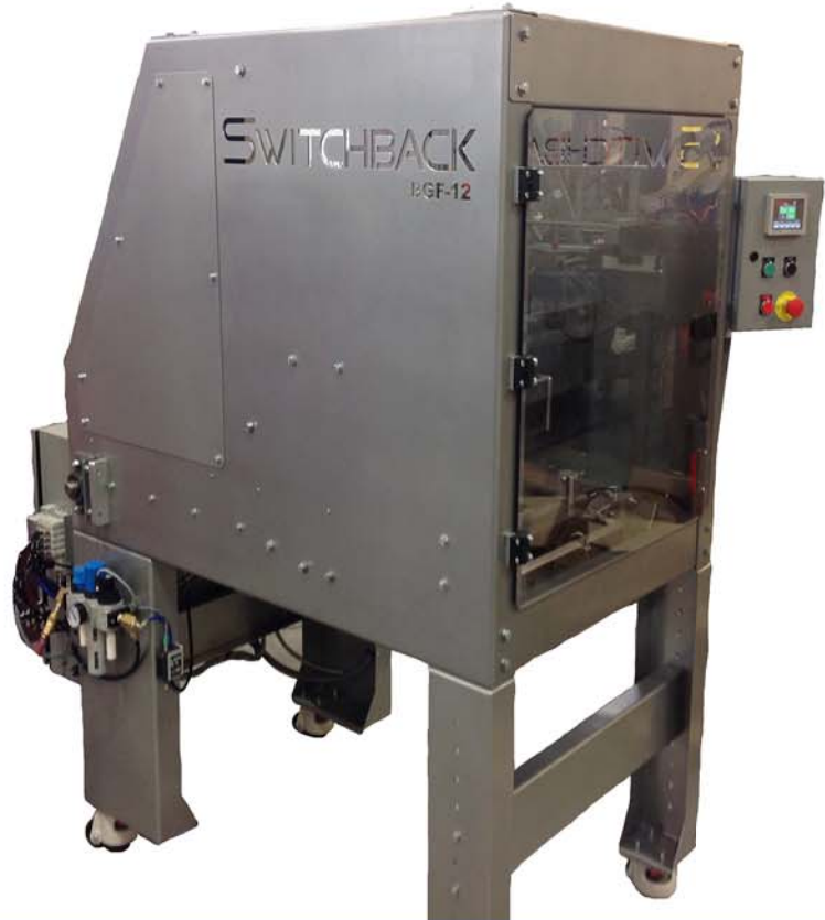
Corrugated Glue Style Trayformer For Brewery Trays