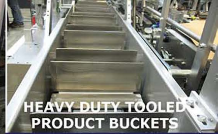
HEAVY DUTY TOOLED PRODUCT BUCKETS