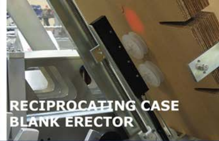
RECIPROCATING CASE BLANK ERECTOR