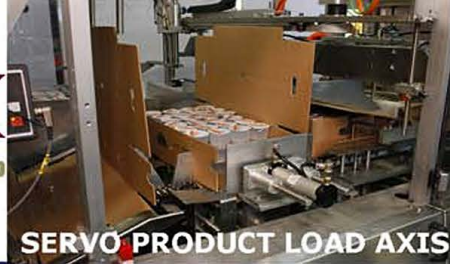
SERVO PRODUCT LOAD AXIS